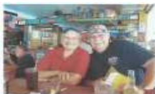
Lunch at the RamShackle Cafe in Leesburg