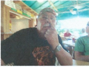
Diggin for nose gold at Harry and the Natives