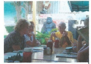
Someone give that lady a Snickers Bar !